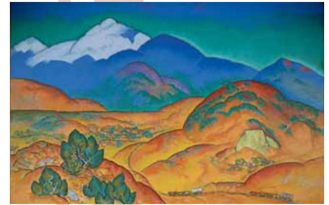
"Old Santa Fe Trail"