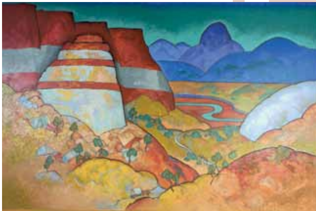
"The Old Cuba Road"

NATIONAL CONFERENCE IN SANTA FE, NEW MEXICO