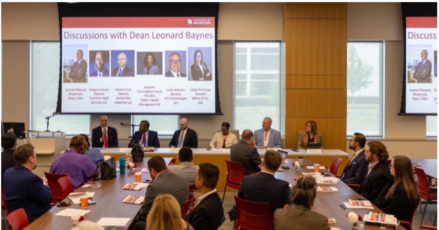
9th Annual North American Environment, Energy, and Natural Resources Conference, “Rewiring the Future: How Technology, Policy, and Investment Are Empowering the New Electricity Era,” April 17, 2025.

Industry leaders, lawyers, policymakers, and academics came together for the ‘Rewiring the Future: How Technology, Policy, and Investment are Empowering the New Electricity Era’ event. Keynote speakers offered an overview of the sector from a federal and state perspective, while two panel discussions provided on-the-ground assessments of current conditions. Tariffs levied by the current administration, including taxes of more than 100% on imports from China, were a main topic of discussion.