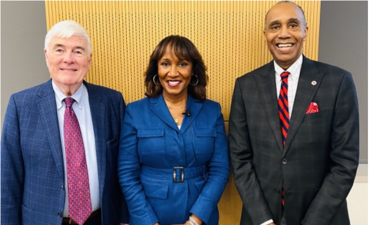
7th Annual Denney L. Wright International Energy Tax Conference and the 25th Annual Houston Business and Tax Law Journal Symposium, "International Energy Investment Challenges," February 28, 2025.

Below are a few of our recent EENR conference highlights. For more information, please visit us here .