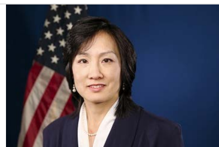
Under Secretary of Commerce Michelle Lee will speak at UH.

Michelle K. Lee , Under Secretary of Commerce for Intellectual Property and director of the U.S. Patent and Trademark Office (USPTO), will meet with faculty and community members at the University of Houston Friday, March 11.