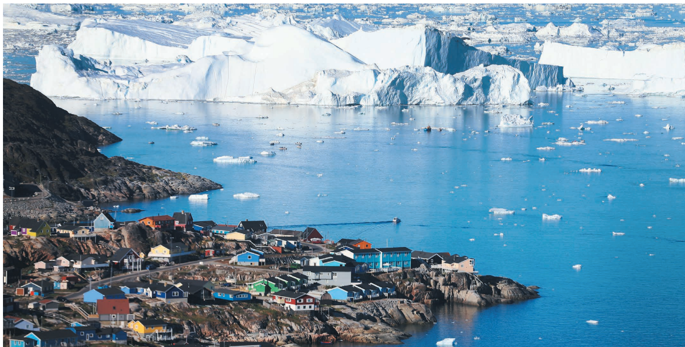
The village of Ilulissat in western Greenland is surrounded by icebergs that have calved from the Jakobshavn Glacier.